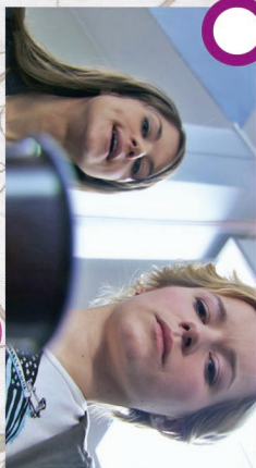
Leisurely drinking some hot chocolate