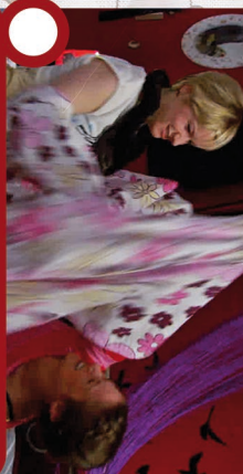
Roarr! ... pillow fight