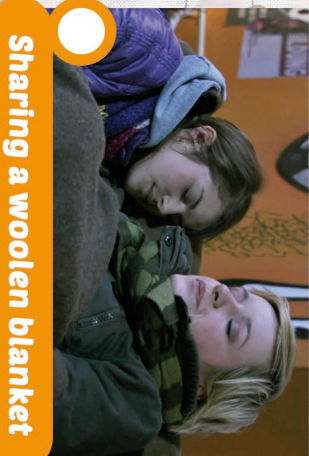
Sharing a woolen blanket